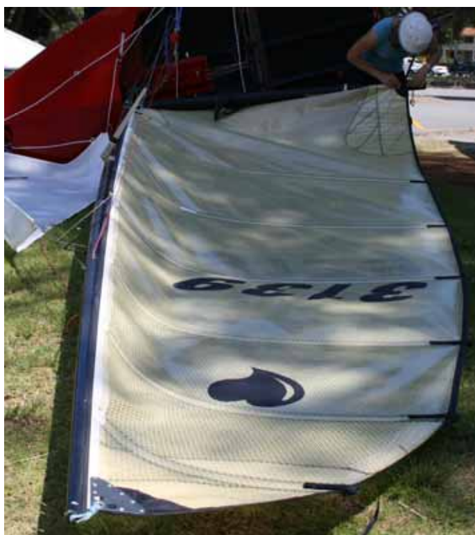
Lisa and Steve Walter's boat Redback with its CST mast, showing the smooth tapered lines of the new design.