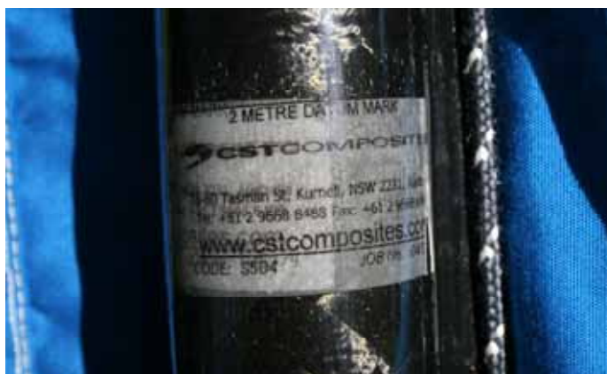
The permanent datum mark laminated into the spar allows easy assessment of the stiffness of the tip by a simple distance measurement from the datum to the tip.

"We can now engineer the stiffness of any individual mast to suit the design crew weight. If a customer provides us with their desired bend curve, as Leigh Ashwood did, we can manufacture a mast to that stiffness. We can also change the proportion of carbon and glass track to finely tune the fore and aft bend. The method needed to measure the bending characteristics of a mast is set out in one of the 'How to' fact sheets on our web site."