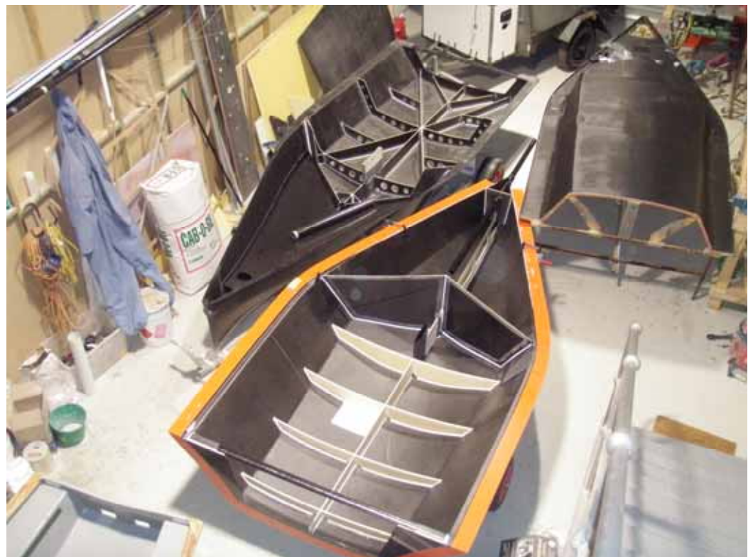
Right: The production floor at Complete Composites in Perth is currently full of Cherub building projects.

Winter is the Cherub building season and this year there are a number of interesting projects underway across the country. The success of the last two National Championships seems to have led to an enthusiastic interest in the Adelaide series to be held at Largs Bay and several people will be going to Adelaide with new or full re-built boats.