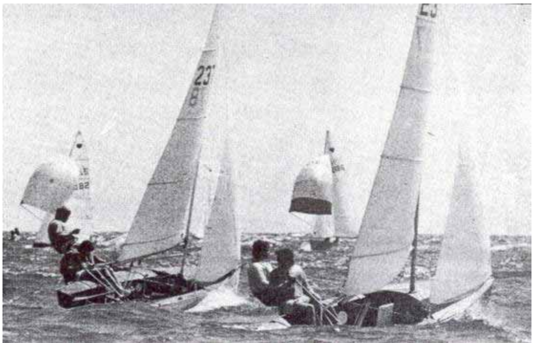
Cherub Worlds provided plenty of action with fresh wind conditions off Adelaide's Henley Beach.

In the light conditions of the nationals, McAlary, using Bethwaite hull and spars with Burke sails (NSW) mastered the light conditions so well that no other boat could